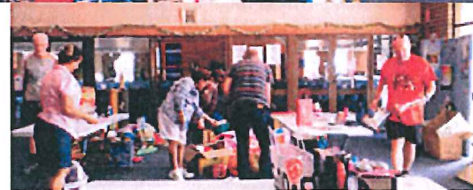
Packing Christmas Hampers 19th December, 2013