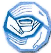
The hand of love offers the cup