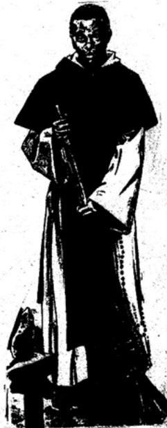
St Martin de Porres Parish Church

3 Berrima Road Sheidow Park Telephone 322 1158