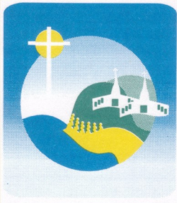
St Martin de Porres

Hallett Cove Catholic Community Church: St Martin de Porres, 1 Berrima Rd, Sheidow Park Office: 3 Berrima Road, Sheidow Park Ph 7183 4823—Tuesdays only Email: hcparrish@adam.com.au